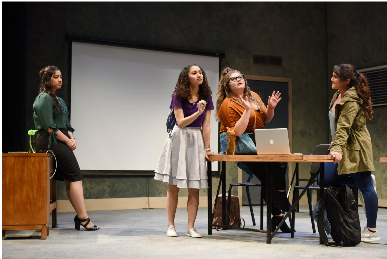
Where it began: good friday at Arizona State University, Winter 2019