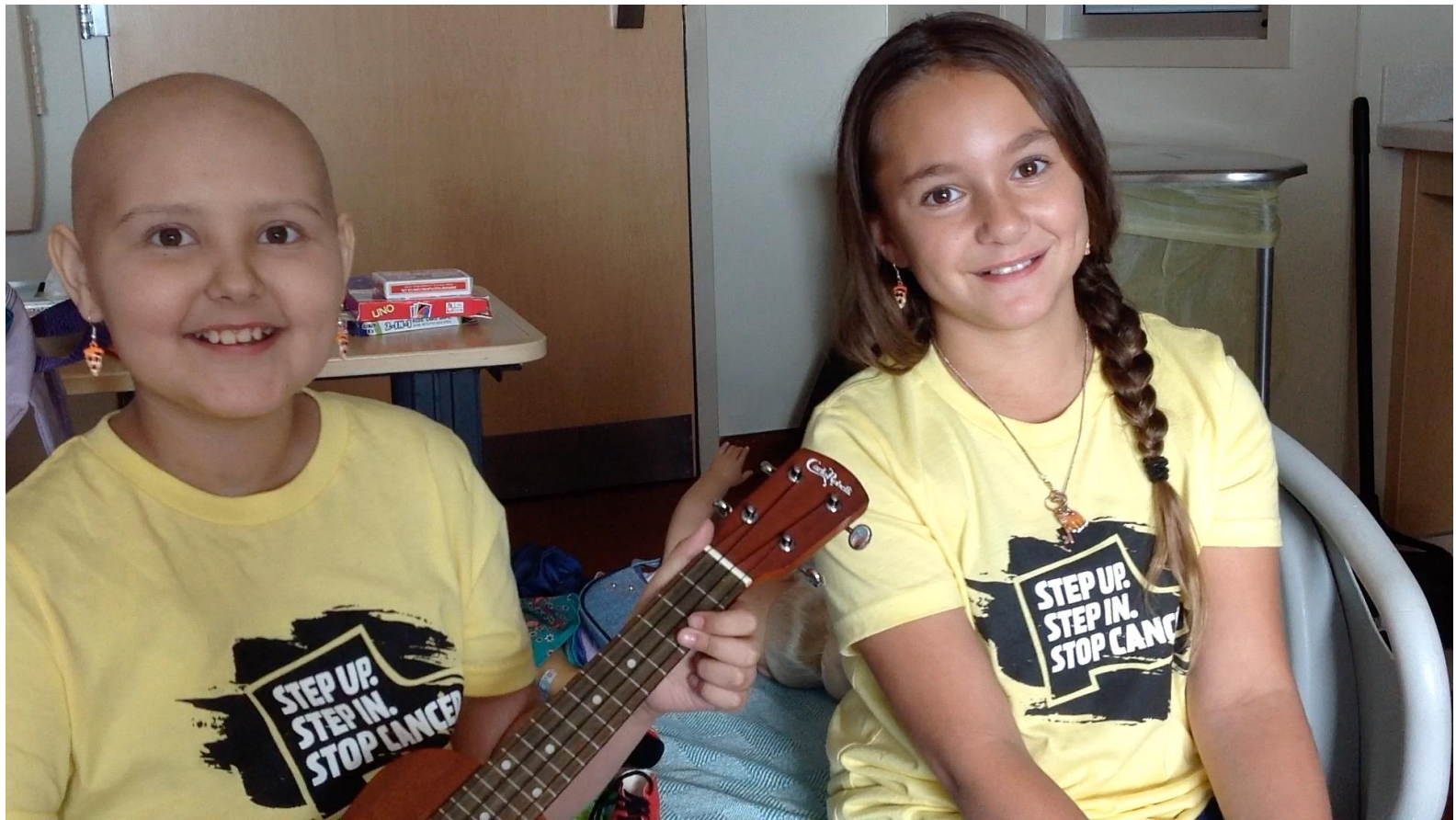
iCreate: A digital storytelling collaboration at Phoenix Children's Hospital, Fall 2018