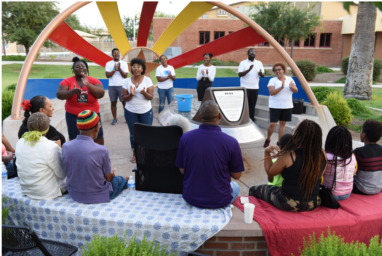
Celebration Eastlake with Sleeveless Acts and the Eastlake Park Community, Spring 2019